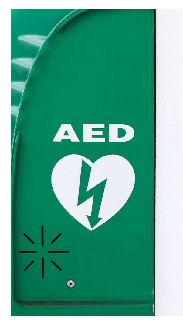
AED's are plentyfull in Denmark. Find a local AED here: <u>https://hjertestarter.dk/find-</u> hjerte<u>startere/find-hjertestartere</u>